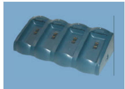
Multiple Battery Charger